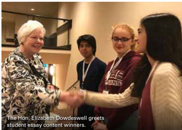
The Hon. Elizabeth Dowdeswell greets student essay content winners.