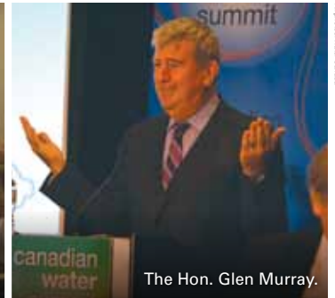
The Hon. Glen Murray.