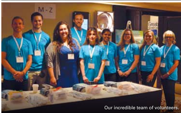
Our incredible team of volunteers.