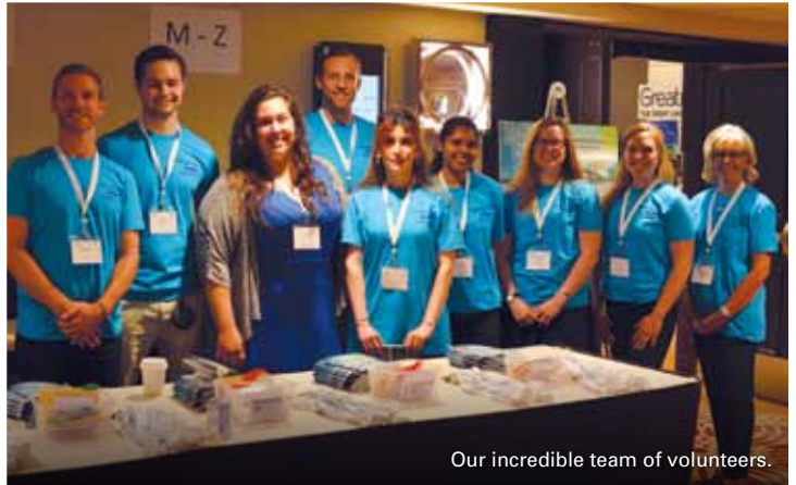
Our incredible team of volunteers.