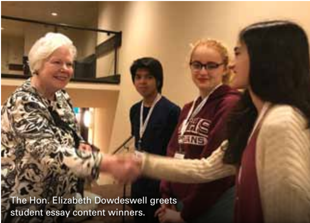
The Hon. Elizabeth Dowdeswell greets student essay content winners.