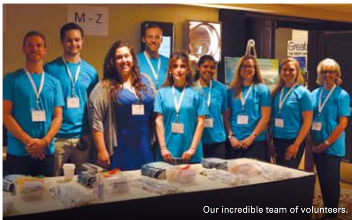
Our incredible team of volunteers.